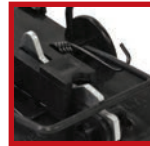
Improved metal hardware for longevity & strength