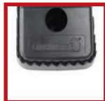
Available for private label