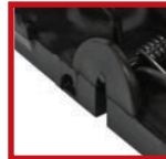
Multiple Anchor Points