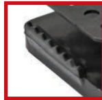
Raised teeth for extra holding power