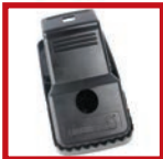
Easy access bait tray