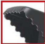
Gripping teeth for improved holding power