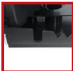
Anchor point for use on pipes, conduites, and racking