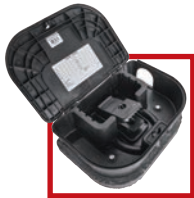
Fits low profile bait stations such as the RBS 1EZ-Secured™